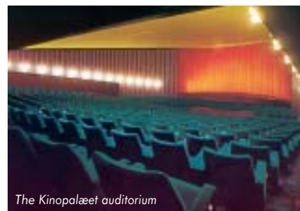
The Kinopalæet auditorium

" South Pacific " was the opening movie at the 3 Falke. Todd-AO made quite an impact in those days and 782, 710 people saw the film in 201 weeks. It was THE 70mm house of Denmark and even hosted a couple of 70mm premieres for all Europe (" Where Eagles Dare " and " Gone With the Wind "). During the first 9 years 3 Falke premiered around 20 films (12 in 70mm). 92% of the BO return came from the 70mm films! The seventies proved to be more difficult and films changed very often, compared to the previous decade. Only 6 films stayed on 3 Falke Bio's vast canvas for more than 3 months from 1970 until closure in 1982. " The Godfather " (9 months), " The Great Gatsby " (5 months), " Hello, Dolly! ", " Kelly's Heroes " and " Earthquake " (all 4 months), " Close Encounters of the Third Kind " (3 months).