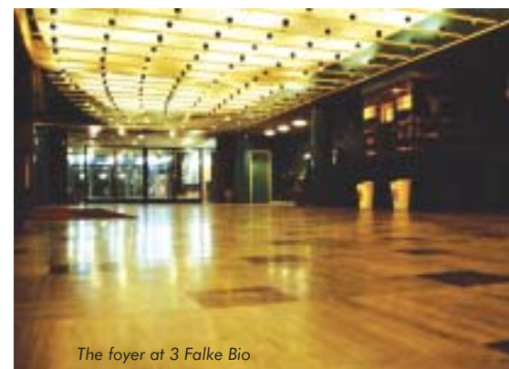
The foyer at 3 Falke Bio

The Imperial and Kinopalæet box offices were located nearly on the sidewalk whereas 3 Falke Bio, not even on the main road, was "hidden away" in a courtyard, sharing the taxi kiss-and-ride entrance with the hotel and concert venue. For years 3 Falke's audience complained about standing outside in the rain and snow buying their tickets. The problem wasn't solved until 1986, 4 years after the closure, when the entire courtyard was covered with a glass roof. Additionally the 3 Falke foyer was quite small and in fact not designed for 1000 guests. It was a major design error and it plagued the cinema for years during intermissions.