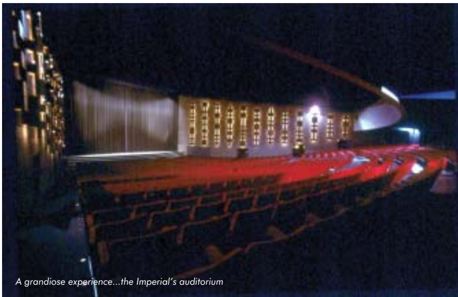
A grandiose experience...the Imperial's auditorium

In short, 3 Falke Bio had the best view to the screen, the best seats were at Kinopalæet and the most grandiose experience was at Imperial.