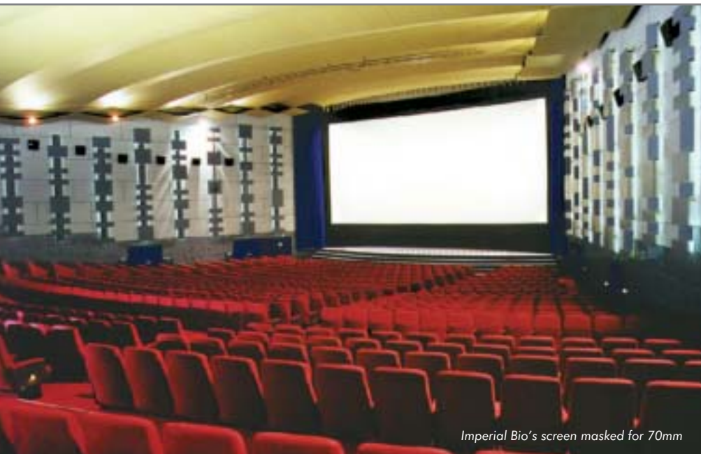
Imperial Bio's screen masked for 70mm

installed for SDDS. Since 1979, JBL speakers have been at Imperial making it the largest JBL cinema installation in Denmark.