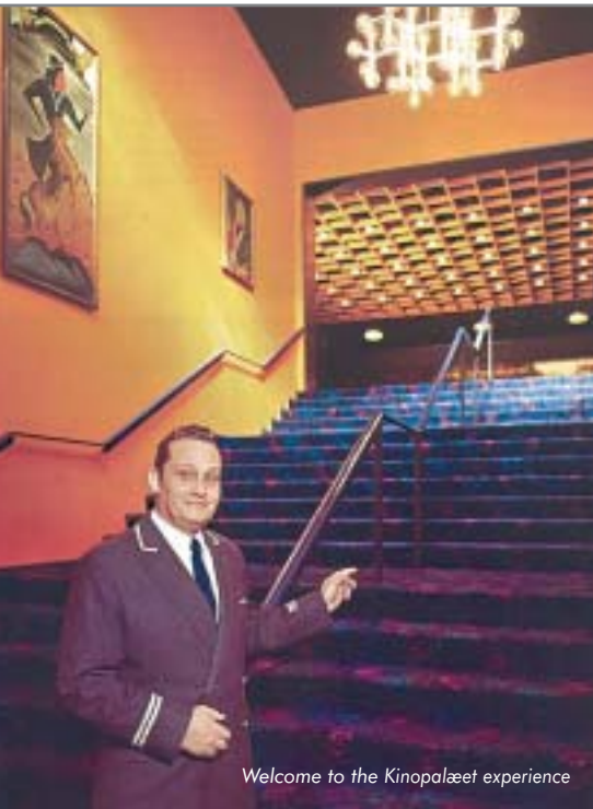
Welcome to the Kinopalæet experience

For the past 20+ years, many people have regarded one cinema in Copenhagen as the most luxurious cinema ever built in Denmark - The Imperial. Imperial, still state-of-the-art, is the benchmark to which many cinemas are compared. The audience today are probably not aware that, 40 years ago, when the Imperial opened, there were actually several cinemas of similar standard.