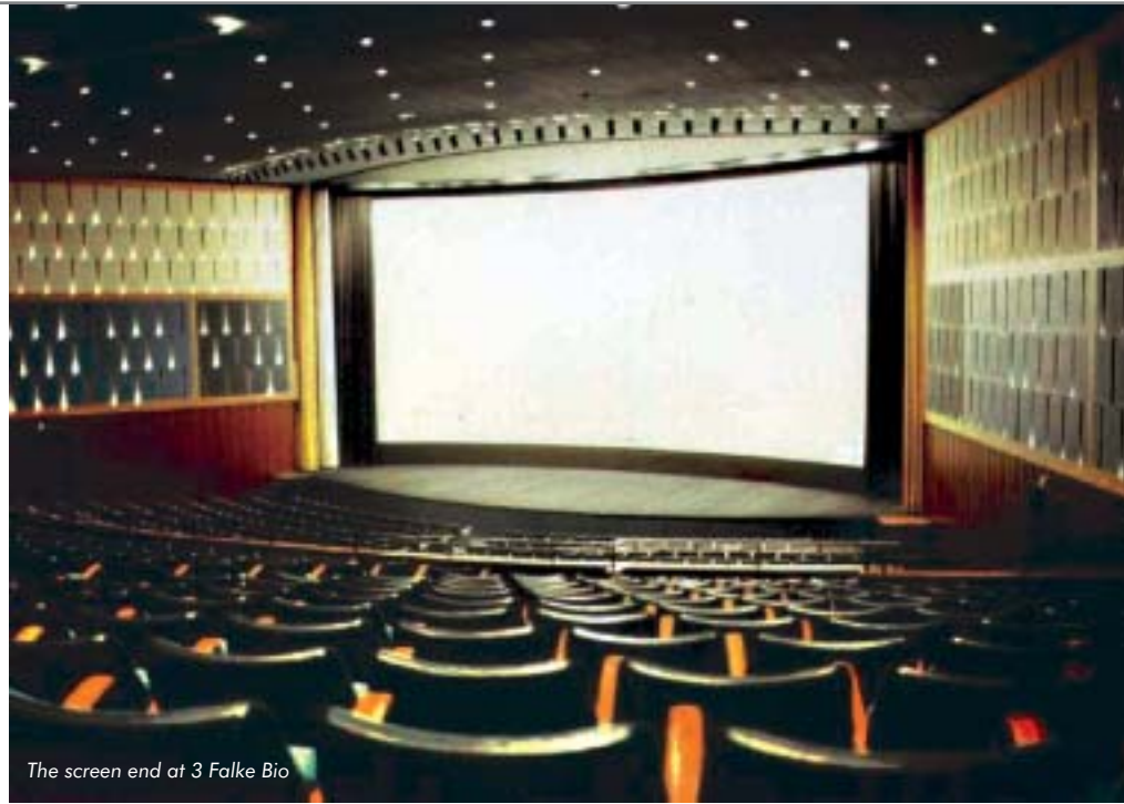
The screen end at 3 Falke Bio

Although all three cinemas were big and spectacular they were quite different from each other. The 3 Falke Bio and Kinopalæet, designed by the same architect, were both intimate, due to the dark color scheme used in the foyer and cinema. The Imperial never had this feeling of intimacy because of the use of marble, steel and a brighter color scheme. And with 1521 seats, Imperial was considerably larger than 3 Falke and